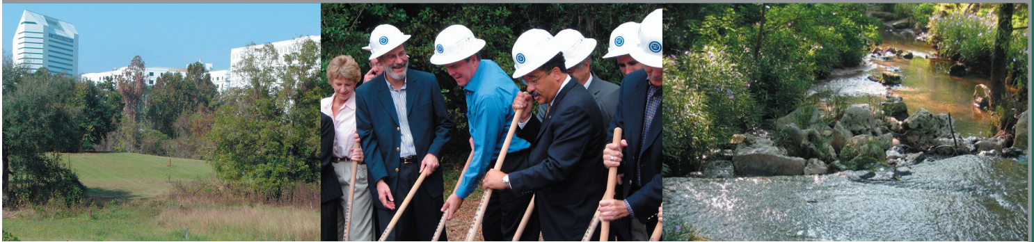
Images from left to right: View from the site looking northwest toward downtown Tallahassee; remedial activities at the site began with a ground breaking ceremony on November 15, 2005; and the scenic St. Augustine Branch traverses the site.

Intersection of Gadsden & Bloxham, Tallahassee, Florida 32301